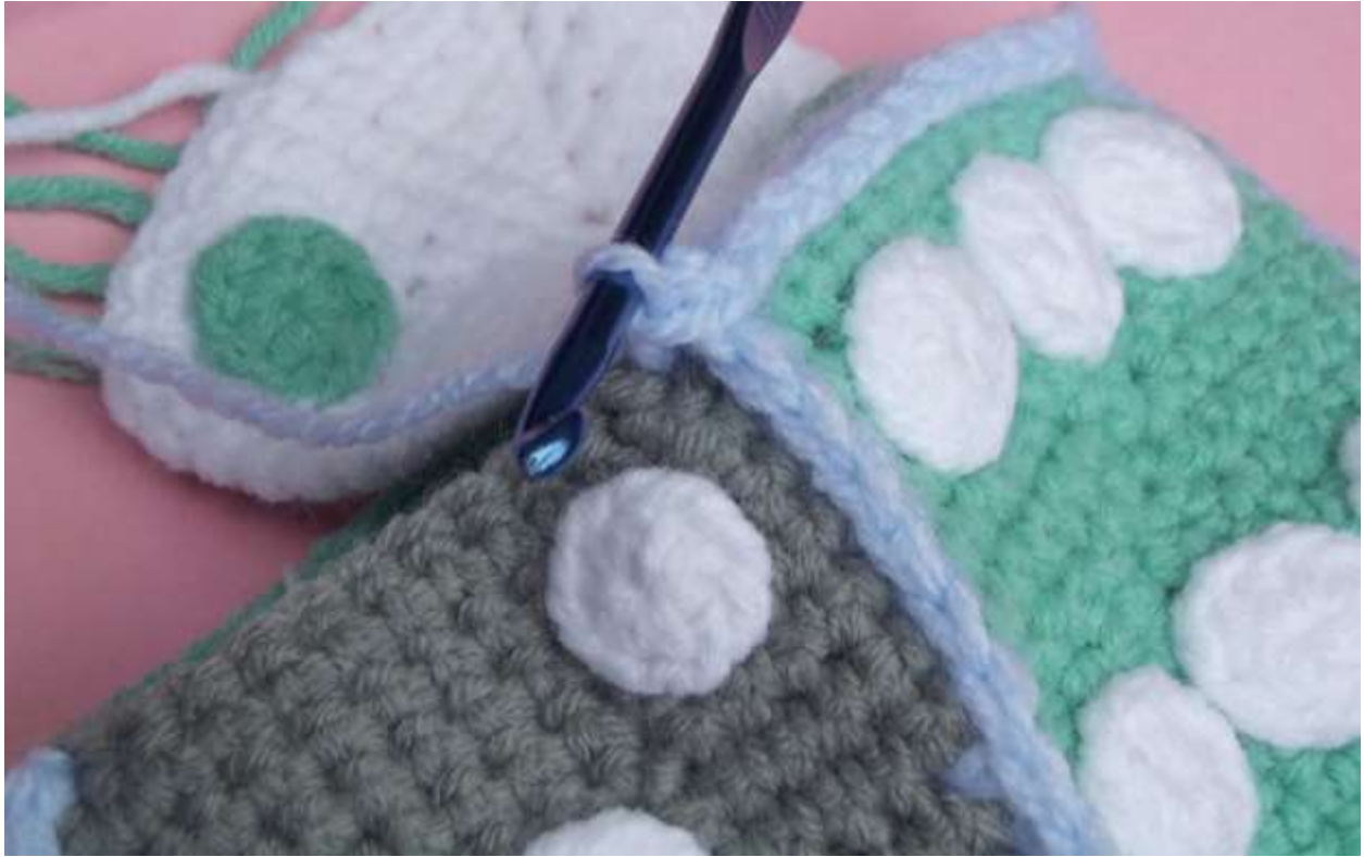
front & back view of the same corner point